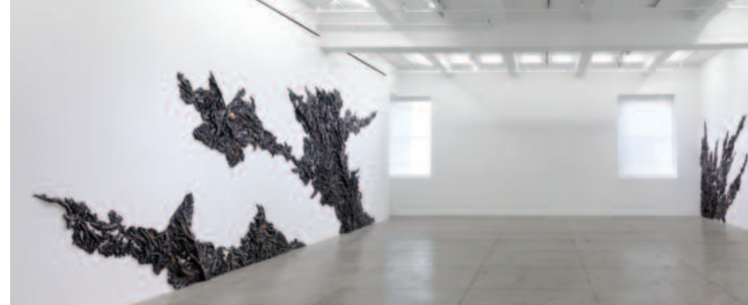
Above: Installation view of “Entwined,” 2017. Right: Entwined Growth III (detail), 2017. Cast aluminum patinated and poly-carbonated with pigment, 90.75 x 151.5 x 2.75 in.

TOP: ATTILIO MARANZANO, © CRISTINA IGLESÍAS AND VEGAP / BOTTOM: KRISTEN DAEM, © CRISTINA IGLESÍAS AND VEGAP