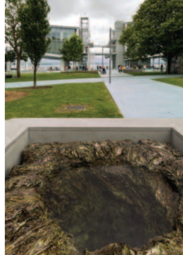
From the Underground , 2017. Stainless steel, pietra serena, mechanics, and water, 2 views of work at the Centro de Arte Botín, Santander.

of the mountain, the rocks, and the water zones under the ground. Toledo is a natural fortress because of the river that flows around the mountain.