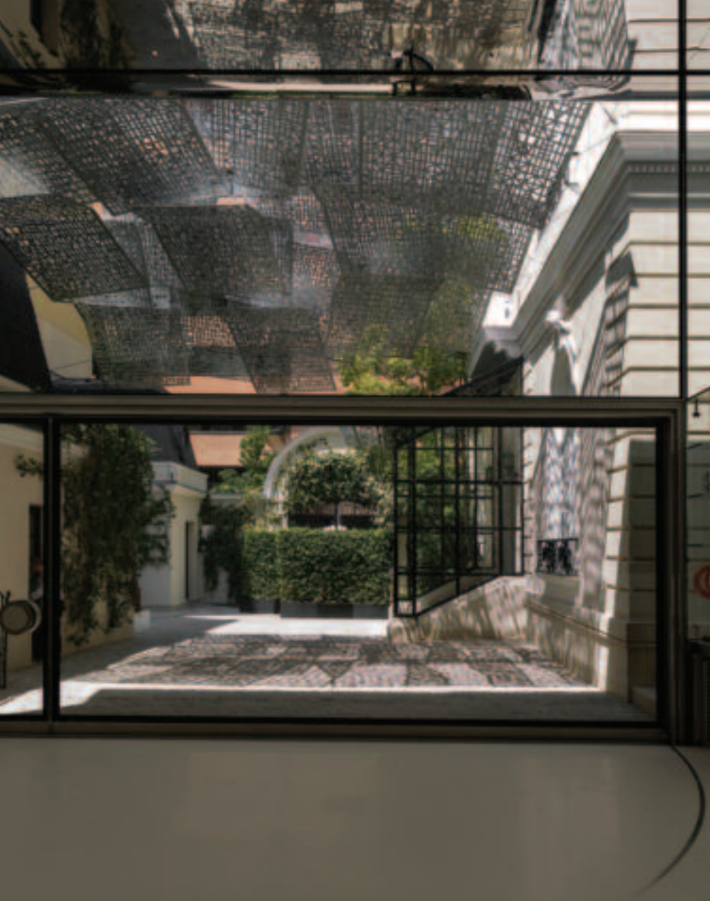
The Ionosphere (A Place of Silent Storms) , 2017. Carbon fiber, cables, and shadow, view of work at the Norman Foster Foundation, Madrid.