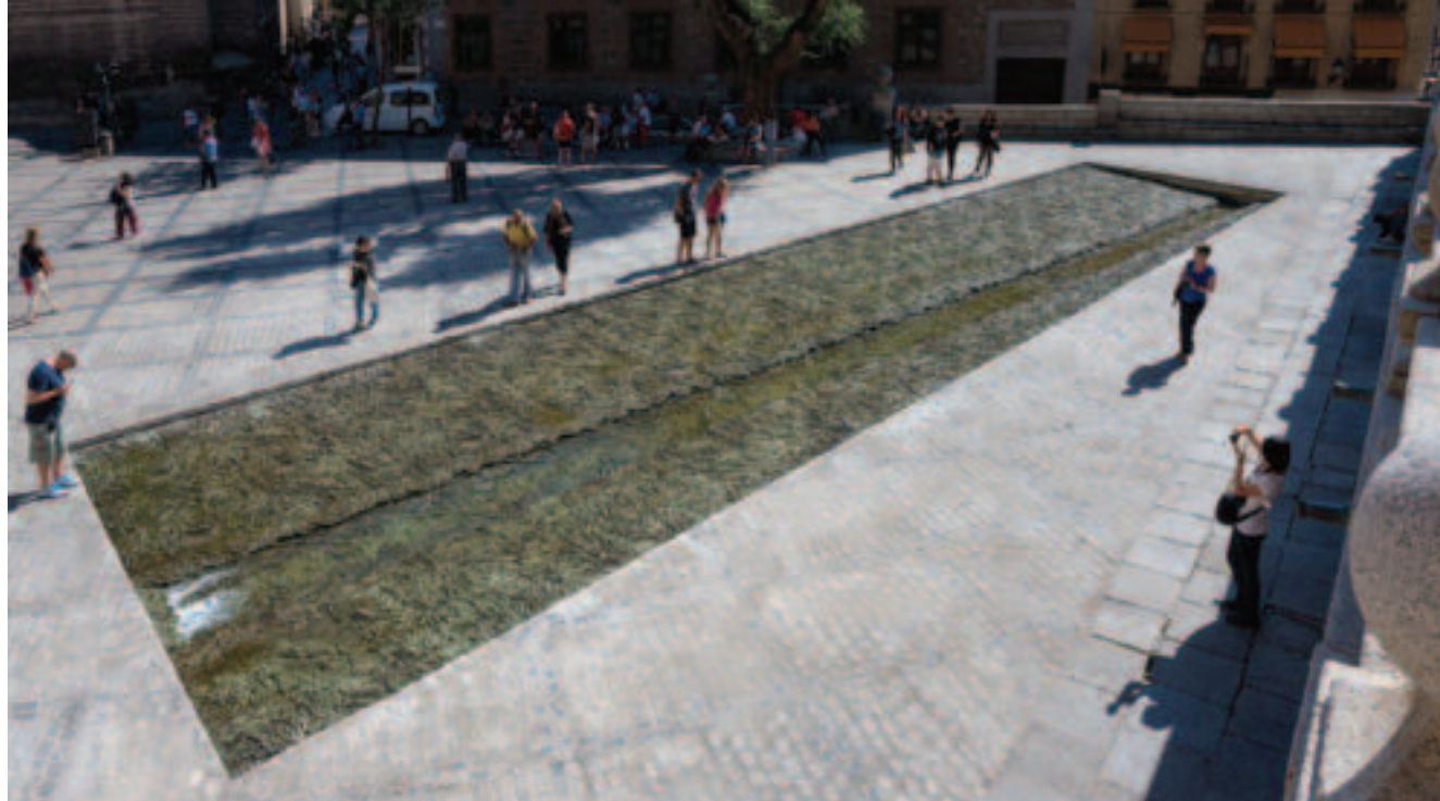
Above: Tres Aguas , 2014. Stainless steel, hydraulic mechanism, and water, 25 x 7.5 meters. View of work at Plaza del Ayuntamiento, Toledo. Right: Tres Aguas , 2014. Stainless steel, hydraulic mechanism, and water, 970 x 580 cm. View of work at the Torre del Agua, Toledo.

that can become volumetric or dissolve. I also used a very resistant transparent polycarbonate resin, which is stronger and harder than glass.