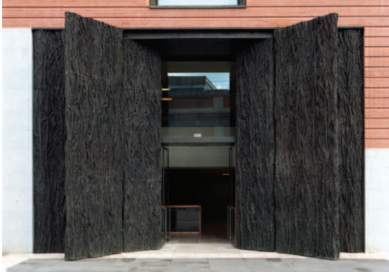
Above: Door—Threshold , 2006–07. Bronze and hydraulic mechanism, 6 x 8.8 x 3.5 meters. Work at the Museo Nacional del Prado, Madrid. Below: Deep Fountain , 1997–2006. Poly-chrome concrete, resin, and water, work at the Royal Museum Antwerp.

Bloomberg were about protecting the building. Instead of building a wall, I used water to create distance with depth. The three large parts took between two and three years to make.